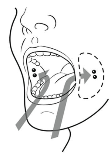
Figure A (2 tablets between your left cheek and gum and 2 tablets between your right cheek and gum).